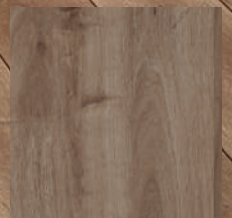
HIGHLAND OAK ROASTED VDHIG5A34018122C15