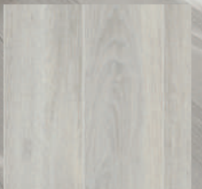
FRENCH OAK POLAR VDFRE5R03018122C15