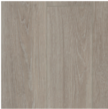
FRENCH OAK LINEN 30