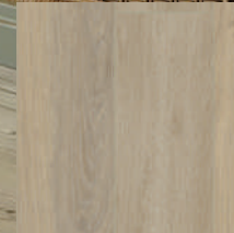
NORWEGIAN WOOD ARCTIC VDNOR5R09018122C15