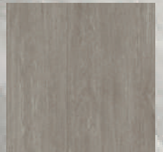
NEW ENGLAND OAK MISTY 93 VDNWE5A93018122C15