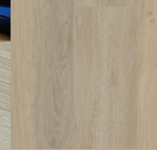
FRENCH OAK DESERT VDFRE5R33018122C15