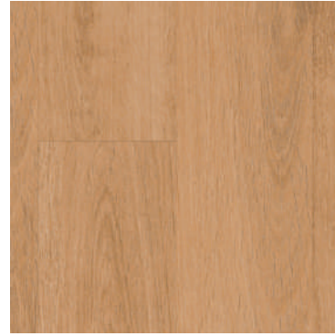
HIGHLAND OAK CLASSIC 33