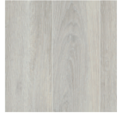
FRENCH OAK POLAR 03