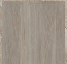
FRENCH OAK LINEN VDFRE5R30018122C15