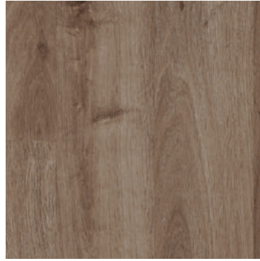
HIGHLAND OAK ROASTED 34