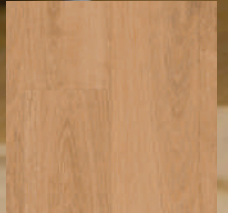
HIGHLAND OAK CLASSIC VDHIG5A33018122C15