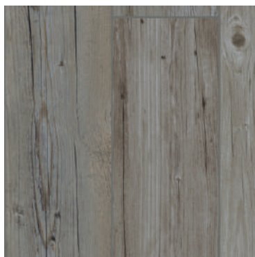
NORWEGIAN WOOD THUNDER 49