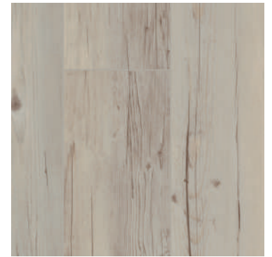
NORWEGIAN WOOD ARCTIC 09