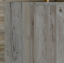
NORWEGIAN WOOD THUNDER VDNOR5R49018122C15