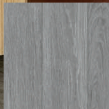
FRENCH OAK STORM VDFRE5R92018122C15