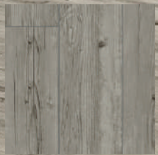
NRWEGIAN WOOD FJORD VDNOR5R39018122C15