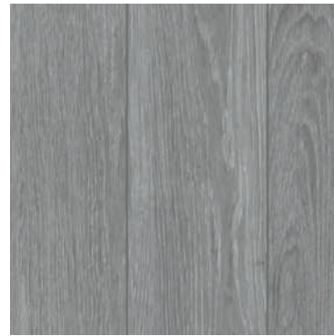
FRENCH OAK STORM 92