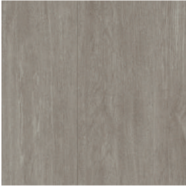
NEW ENGLAND OAK MISTY 93