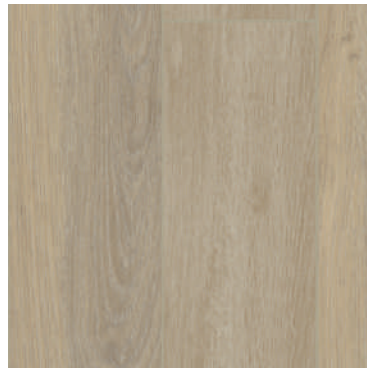
FRENCH OAK DESERT 33